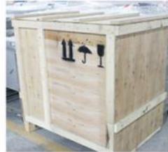
5 Product packaging