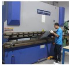
1 Material processing