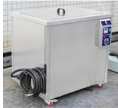
4 Finished product