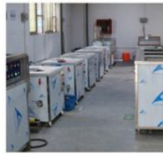
3 Product test