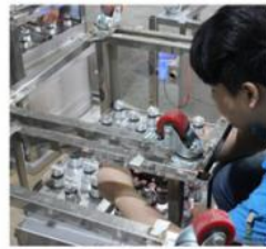
2 Product assembling